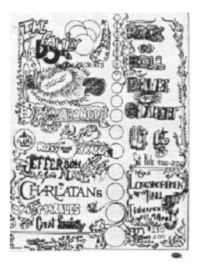
Family Dog First Dance